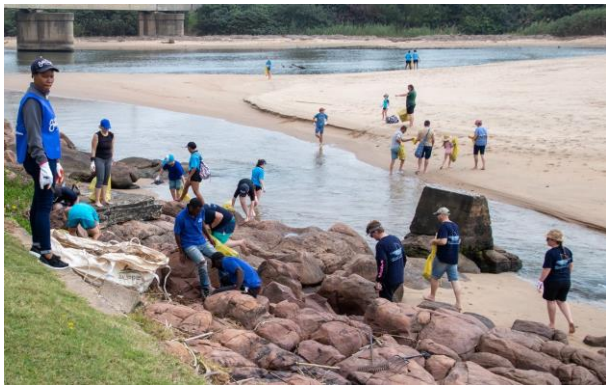
A beach clean-up in progress at Scottsburg in KZN