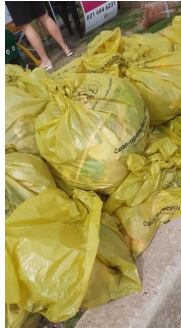
Left: Waste collected and removed from the Milnerton beach on Saturday, 17 September 2022